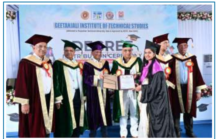
Degree Distribution Ceremony held on 14 th March, 2026 for the graduating students of 2025.