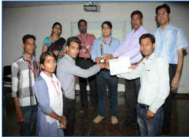
2 nd Prize Vidhya Bhawan Polytechnic College, Udaipur