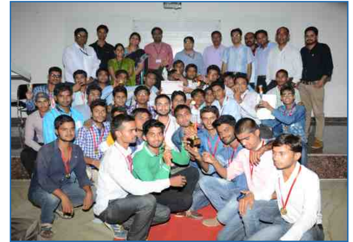
3 rd Prize Govt. Polytechnic College, Banswara