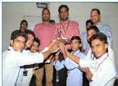
Govt. Ramchandra Khaitan Polytechnic College, Jaipur