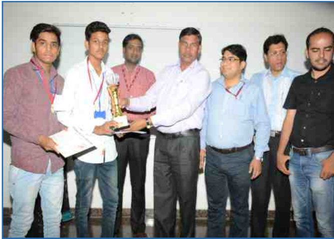
1 st Prize Govt. Polytechnic College, Bikaner