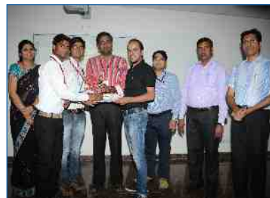
Govt. Polytechnic College, Banswara