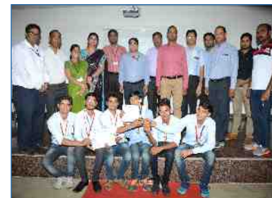
Govt. Polytechnic College, Bikaner