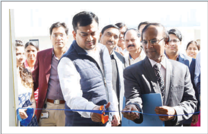
Shri Kapil Agrawal Inaugurating the Solar Energy Center

The objective of the program is to train the students in solar technology installation, commissioning and maintenance of solar power projects and impart the employment opportunities.