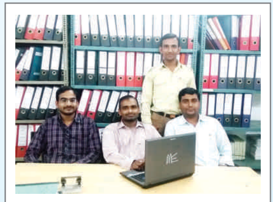
GITS Exam Cell

Prof Dr K N Sheth appreciated the efforts of all heads and faculty members to support such an important activity for building nation through integration of practical training in engineering profession.