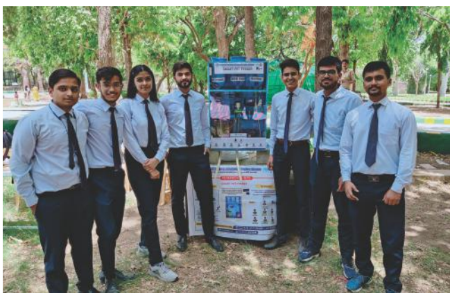
Solar based Smart Pet Feeder System successfully launched at Gulab Bagh, Udaipur