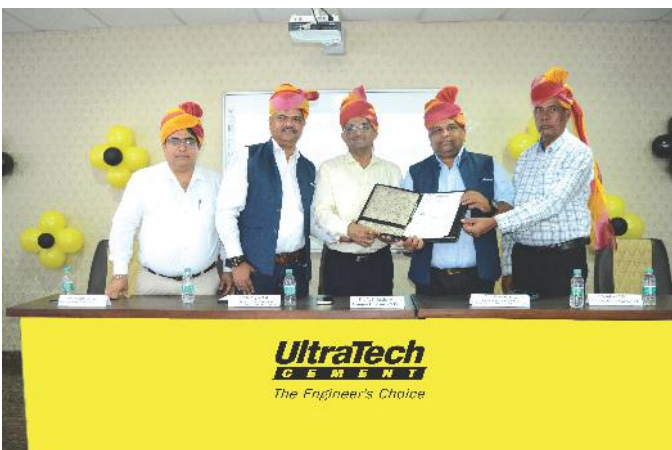
SUSTAINABLE BUILDING MATERIALS