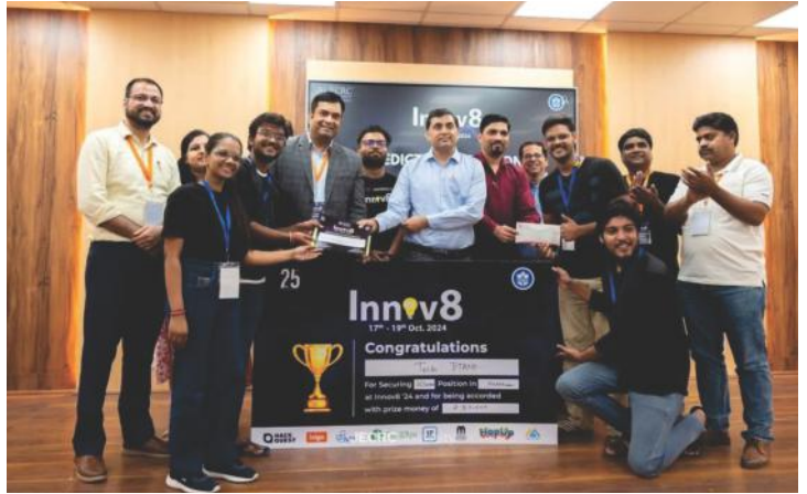
TEAM TECH TITANS WON CASH PRIZE 50,000 IN NATIONAL HACKATHON

FIVE TIMES WINNERS OF SMART INDIA HACKATHON and THREE TIMES OTHER NATIONAL COMPETITION