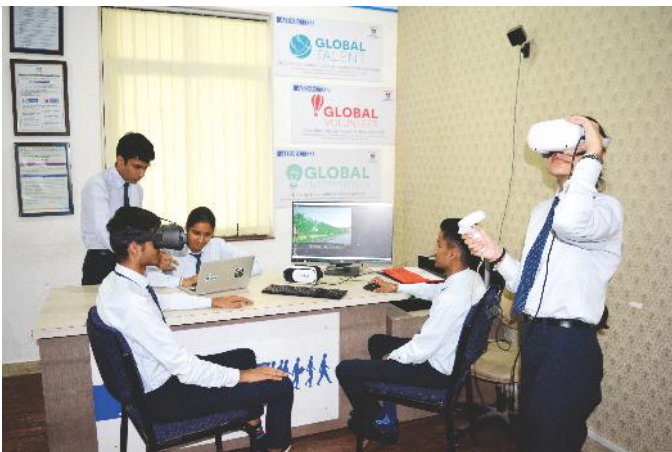
AUGMENTED & VIRTUAL REALITY