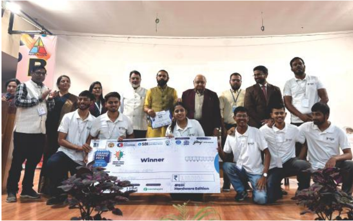
TEAM DEBUGGING EARTH WON THE SMART INDIA HACKATHON-2024 (HARDWARE EDITION)

CONSISTENTLY INNOVATING, CONTINUOUSLY WINNING, FOUR YEARS OF SMART INDIA HACKATHON ORGANIZED BY MINISTRY OF EDUCATION, GOVERNMENT OF INDIA AND AICTE, NEW DELHI